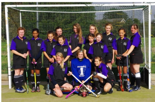
Girls 'younger' Development XI

Women's Norfolk League Development Division Sponsors - King's Lynn Paving & Patios