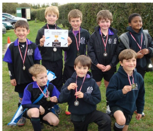
Boys Under 10's