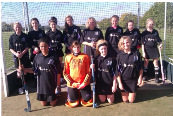
Girls 'Older' Development XI

Women's Norfolk League Premier Division Sponsors - R&D Sports