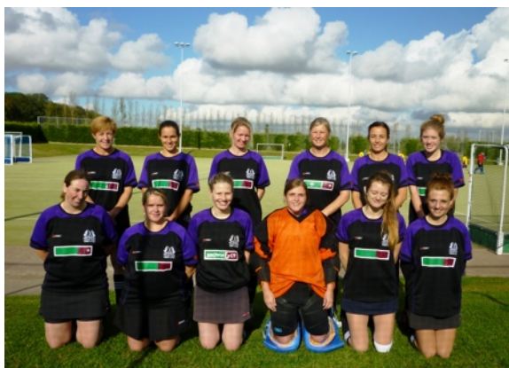
LADIES 1st XI