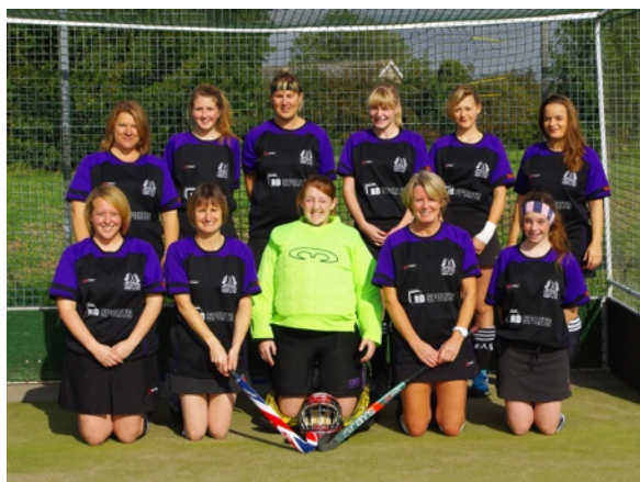
LADIES 2nd XI

Women's East League Division 1 Sponsors - Brown & Co